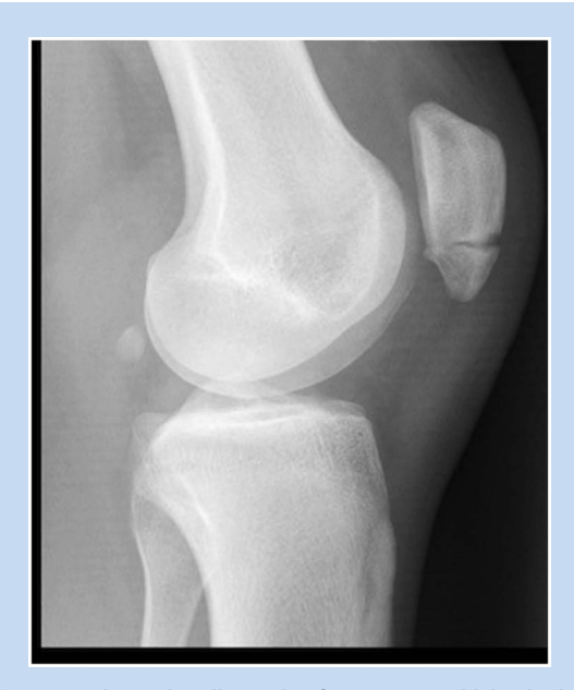
Figure 10. Lateral radiograph of a 20-year-old basketball player with a transverse stress fracture of the inferior third if the patella.