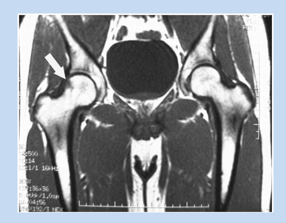
Figure 7. Coronal T1 image demonstrating a right tensionsided femoral neck stress fracture in a 27-year-old military recruit. Image reprinted from Provencher et al<sup>107</sup> with permission from SAGE Publications.

low- to high-risk.<sup>120</sup> High-risk fractures result from tension on the lateral aspect of the femoral neck. They are inherently unstable and prone to displacement (Figure 7).<sup>54</sup> Nondisplaced fractures can be treated with strict adherence to nonweightbearing movements until callus is seen radiographically.<sup>6,28</sup> However, percutaneous screw fixation with 6.5- to 7.3-mm cannulated screws is often used in these high-risk fractures.<sup>21,95</sup>