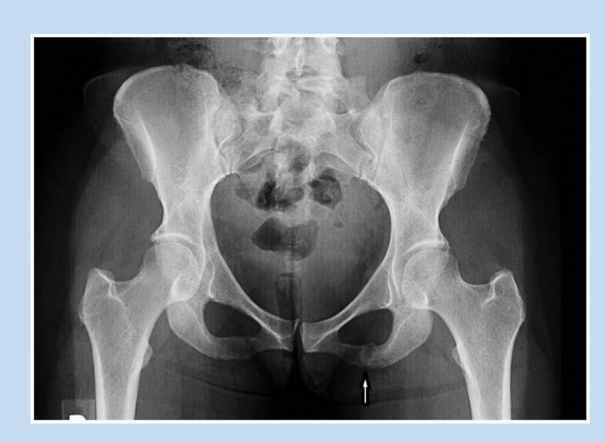
Figure 11. Pelvic stress fracture (arrow) in a 40-year-old distance runner.

An athlete recovering from any stress fracture must comply with a gradual return to activity to allow for bone healing and remodeling. <sup>42,69</sup> An athlete who rushes return to play risks further injury, possibly more serious than the initial insult. <sup>58</sup> Animal studies of nonsteroidal anti-inflammatory