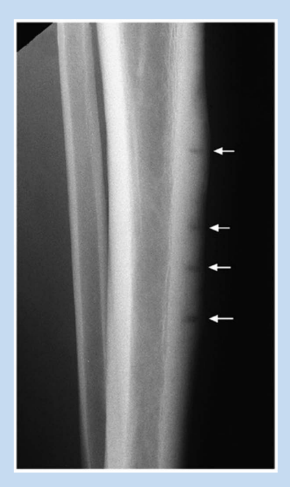
Figure 5. Lateral radiograph of a 21-year-old male football player with intermittent worsening bilateral anterior shin pain. Black lines indicate stress fractures of the anterior tibial cortex. Image reprinted from Fredericson et al<sup>52</sup> with permission from Lippincott, Williams, and Wilkins, Inc.

Fibular stress fractures account for 5.1% to 9.3% of all stress fractures. 65,87,116 Most commonly occurring in the distal third, 19,130