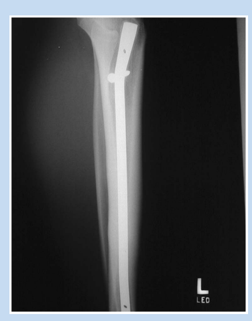
Figure 6. Lateral radiograph of a tibial intramedullary nail in a 20-year-old patient with a chronic anterior tibial stress fracture. Image reprinted from Varner et al<sup>132</sup> with permission from SAGE Publications.