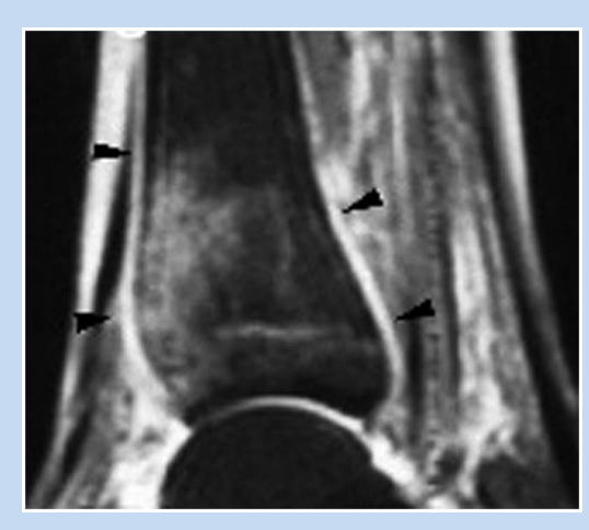
Figure 3. Sagittal fast STIR image of a 19-year-old female volleyball player with right tibial pain for 9 days. Arrows show edema in the distal diaphysis due to stress lesion.

stages, radiographs have a low sensitivity (10%) and are of limited utility. ^{52}\,