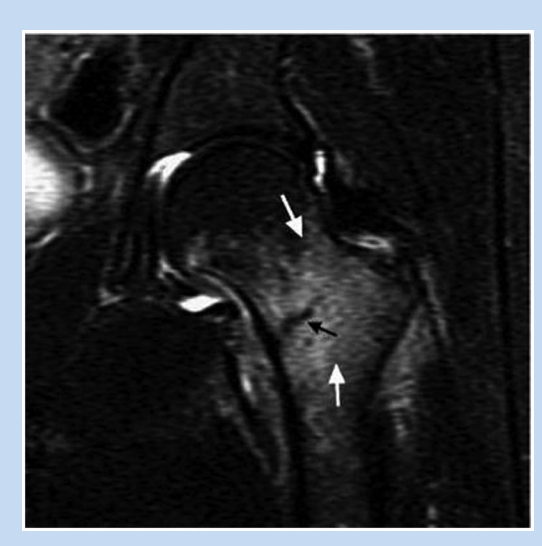
Figure 8. Medial femoral neck fracture on coronal T1 image of a 20-year-old female basketball player. White arrows indicate marrow edema and black arrow points to the fracture line. Image reprinted from Fredericson et al<sup>52</sup> with permission from Lippincott, Williams, and Wilkins, Inc.

low- to high-risk.<sup>120</sup> High-risk fractures result from tension on the lateral aspect of the femoral neck. They are inherently unstable and prone to displacement (Figure 7).<sup>54</sup> Nondisplaced fractures can be treated with strict adherence to nonweightbearing movements until callus is seen radiographically.<sup>6,28</sup> However, percutaneous screw fixation with 6.5- to 7.3-mm cannulated screws is often used in these high-risk fractures.<sup>21,95</sup>