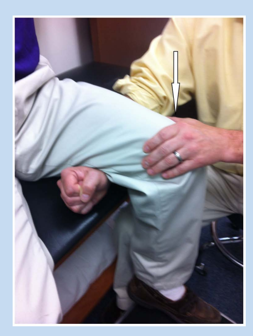
Figure 1. Fulcrum test: Examiner applies downward pressure on the knee with the opposite arm under the patient's thigh. A positive test result elicits thigh pain.

pain usually progresses after activity, eventually leading to pain at rest.<sup>17</sup> Female athletes are 1.5 to 3.5 times more likely to sustain a stress fracture than male athletes,<sup>32,138</sup> and fewer risk factors are known for men.<sup>16,133</sup> Low testosterone levels may increase risk for male athletes.<sup>15,33</sup> African Americans are less prone to stress fractures, possibly due to increased bone mass, size, and geometry.<sup>77,114</sup>